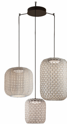
Shown in graphite brown / beige

COLOR RENDERING . . . . . 90 CRI LAMP COLOR . . . . . 2700K LUMENS/WATT . . . . . 457.89 LUMINOUS FLUX . . . . . 4350 lumens