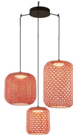
Shown in graphite brown / red

COLOR RENDERING . . . . . 90 CRI LAMP COLOR . . . . . 2700K LUMENS/WATT . . . . . 457.89 LUMINOUS FLUX . . . . . 4350 lumens