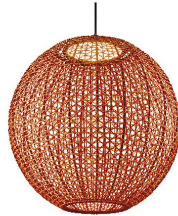
Shown in graphite brown / red