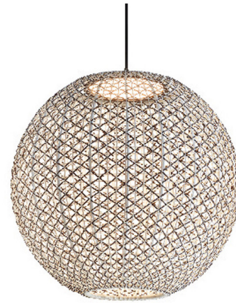
Shown in graphite brown / brown