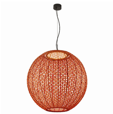
Shown in graphite brown / red