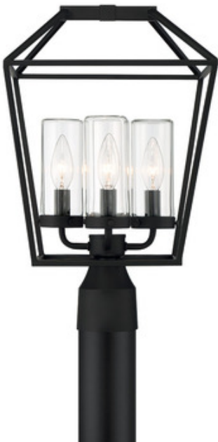
Shown in: Satin Black / Clear

Combining hand-blown glass cylinder shades and a minimal open cage made of black powder coated galvanized steel, the Bastille Post Light blends classic and modern elements into a charming design suitable for pathways, driveways, and other outdoor spaces. It can be a post mount or pier mount. Note: A post or flange is not included and is sold separately.