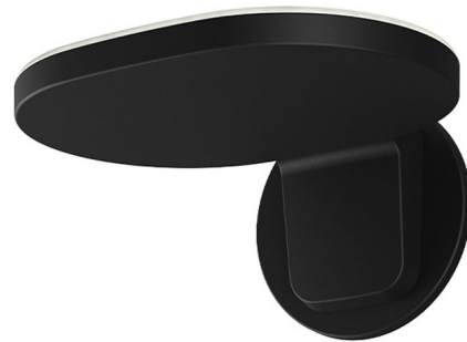
Shown in satin black