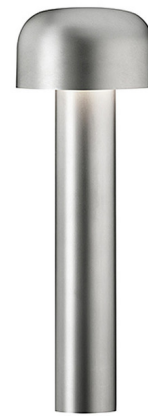
Shown in matte stainless steel / opal

BEAM ANGLE . . . . . 85° COLOR RENDERING . . . . . 80 CRI LAMP COLOR . . . . . 3000K LUMENS/WATT . . . . . 72.50 LUMINOUS FLUX . . . . . 580 lumens