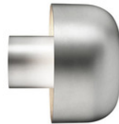
Shown in: Matte Stainless Steel / Opal

Resembling a hatted hotel porter, the Bellhop Outdoor Wall / Ceiling Light delivers illumination and contemporary style, enhancing a range of outdoor settings. LEDs housed in the lamp head shine through an opal optic diffuser for smooth homogenous lighting. The painted finishes are exterior-rated epoxy polyester powder coats that ensure superior strength and resistance to heat and UV. Integral non-dimmable LED driver included.