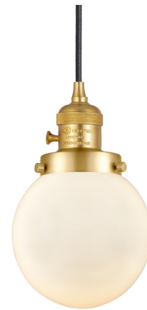
Shown in satin gold / matte white

PRODUCT DIMENSIONS . . . . . Adjustable Cable Length: 120"