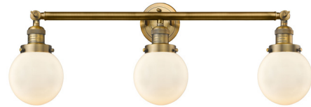
Shown in brushed brass / matte white

PRODUCT DIMENSIONS . . . . . Backplate: 4.5" diameter LAMP LIFE . . . . . 2000 hours