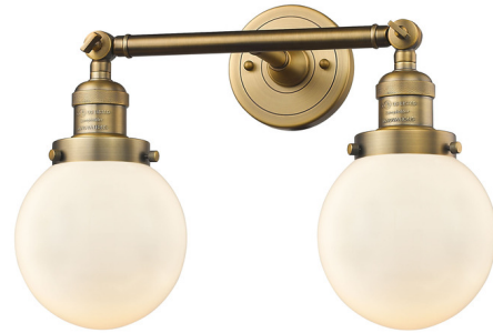
Shown in brushed brass / matte white