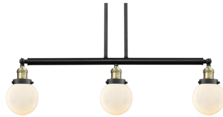
Shown in black / antique brass / matte white

PRODUCT DIMENSIONS . . . . . Downrods: Two 6" and Four 12" Included LAMP LIFE . . . . . 2000 hours