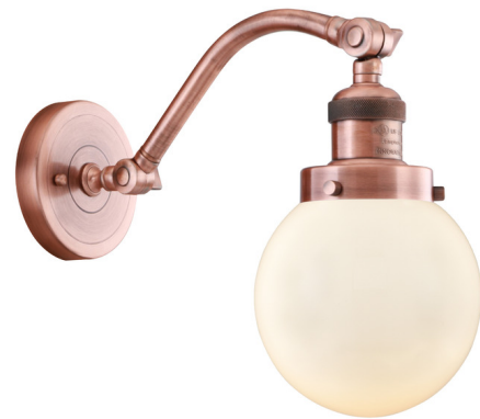
Shown in antique copper / matte white

The Beacon 515 Wall Sconce adds a clean classic look to your interior space. The smooth industrial lamp holder holds a decorative rim and is complemented by a smooth glass globe that casts warm shadows across your room. The curved arm features a 180 degree adjustable swivel at both ends. May be mounted up or down.