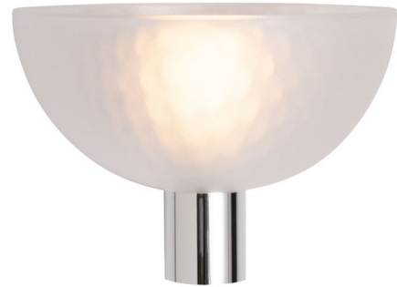
Shown in silver / crystal

The FATA Wall Sconce features a bowl-shaped mold forming and engraving process that reflects light in infinitely different ways depending on how you view the lamp. As soon as Fata is switched on, it becomes hidden in an amazing game of light, like a little magic tower that adds mystery and cheer to the home. Made of recycled thermoplastic, it guarantees aesthetic quality. Junction box included.