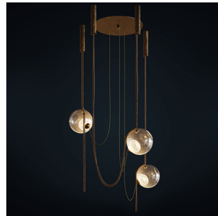
Shown in dark aged brass / textured hand blown glass

PRODUCT DIMENSIONS . . . . . Shade: 8" diameter LAMP COLOR . . . . . 2700K Warm Dim