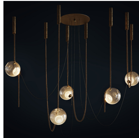
Shown in dark aged brass / textured hand blown glass

The Abysses Chandelier is a versatile fixture inspired by the organic shapes and textures of the sea. To evoke the look of floating bubbles, handblown textured glass globes are suspended from aged brass chains that dangle gracefully like flowing seaweed. Each globe houses an integrated LED light source that is obscured by clear bubbled glass to softly diffuse the light. The chains are anchored to the ceiling with hand textured metal cylinders that also add visual weight to the light and airy design. Assembled with expert craftsmanship at Larose Guyon's workshop in Quebec, the sculptural Abysses exemplifies elegant simplicity. Note: Chain lengths are not adjustable. Overall height to order, available from 48 in. to 120 in. 30W Constant Current driver is included.