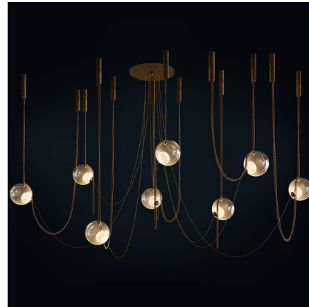
Shown in dark aged brass / textured hand blown glass

The Abyss Chandelier is a versatile fixture inspired by the organic shapes and textures of the sea. To evoke the look of floating bubbles, handblown textured glass globes are suspended from aged brass chains that dangle gracefully like flowing seaweed. Each globe houses an integrated LED light source that is obscured by clear bubbled glass to softly diffuse the light. The chains are anchored to the ceiling with hand textured metal cylinders that also add visual weight to the light and airy design. Assembled with expert craftsmanship at Larose Guyon's workshop in Quebec, the sculptural Abyss exemplifies elegant simplicity. Note: Chain lengths are not adjustable. Overall height to order, available from 48 in. to 120 in. 40W Constant current driver is included.