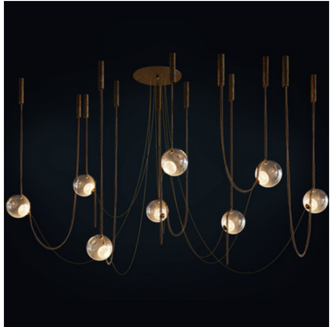
Shown in: Dark Aged Brass / Textured Hand Blown Glass

The Abysses Chandelier is a versatile fixture inspired by the organic shapes and textures of the sea. To evoke the look of floating bubbles, handblown textured glass globes are suspended from aged brass chains that dangle gracefully like flowing seaweed. Each globe houses an integrated LED light source that is obscured by clear bubbled glass to softly diffuse the light. The chains are anchored to the ceiling with hand textured metal cylinders that also add visual weight to the light and airy design. Assembled with expert craftsmanship at Larose Guyon's workshop in Quebec, the sculptural Abysses exemplifies elegant simplicity. Note: Chain lengths are not adjustable. Overall height to order, available from 48 in. to 120 in. 40W Constant current driver is included.