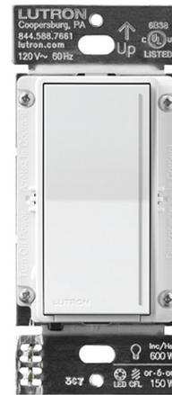
Shown in gloss white