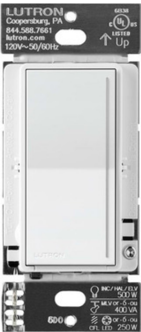
Shown in: Gloss White

Adjust your lighting with a simple touch or swipe using the Sunnata PRO LED+ Touch Dimmer. Advanced PRO LED+ technology provides maximum flexibility, enabling phase selectable dimming of a broad range of load types. Superior dimming for dimmable LED/CFL bulbs up to 250W, incandescent/halogen/ELV up to 600W, and MLV up to 400 VA. Touch or swipe the light bar to dim or brighten your lights. Use the rocker switch to turn lights on and off. Lights gradually fade on and off for comfortable eye adjustment. Light bar glows for finding it in the dark. MyLevel Personalization features allow you to program a preset light level, adjust light bar brightness or turn it off, set low-end and high-end trim to maximize bulb performance, and set forward or reverse phase. RTISS technology reduces light flickering by compensating in real time for incoming line voltage variations. Can be used single-pole or in a multi-location application with up to 4 matching companion dimmers (Lutron ST-RD, sold separately) for a total of up to 5 control locations. Not compatible with mechanical switches. Screw terminals make wiring easy. Neutral wire required. Note: Wall plate sold separately.