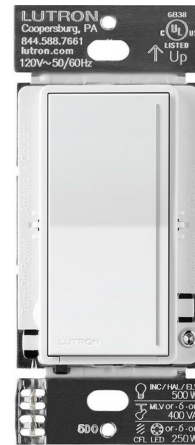
Shown in gloss white