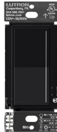
Shown in gloss black