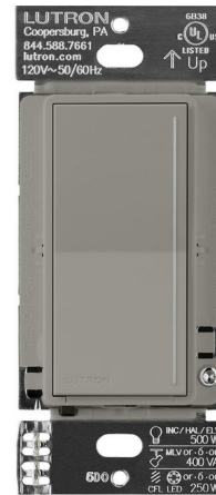
Shown in satin cobblestone