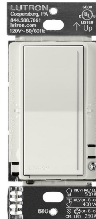
Shown in satin lunar gray