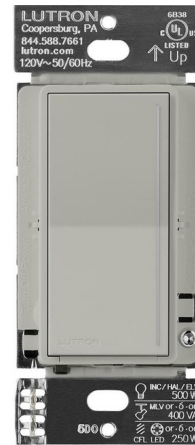
Shown in satin pebble