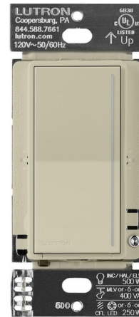
Shown in satin clay