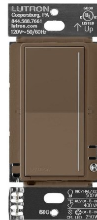
Shown in satin espresso

COLOR N/A BODY FINISH Satin Espresso WATTAGE 250W DIMMER N/A DIMENSIONS 2.938"W x 4.688"H x 1.438"D BULB N/A