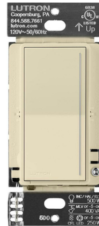
Shown in satin sand