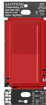
Shown in satin signal red

COLOR N/A BODY FINISH Satin Signal Red WATTAGE 250W DIMMER N/A DIMENSIONS 2.938"W x 4.688"H x 1.438"D BULB N/A