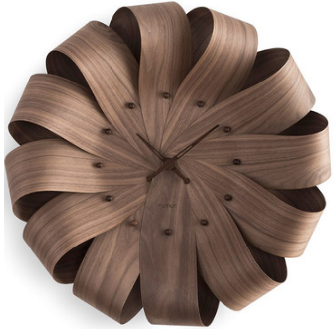
Shown in: Walnut / Walnut

The Brisa Wall Clock features a silhouette that connects us with nature, emulating an open flower in all its splendor. The modern wall clock is composed of natural walnut or oak leaves, with hands and hour markers available in either brass, walnut or both. The subtle bentwood folds create three-dimensional shapes that evoke nature. Requires 1 AA battery.