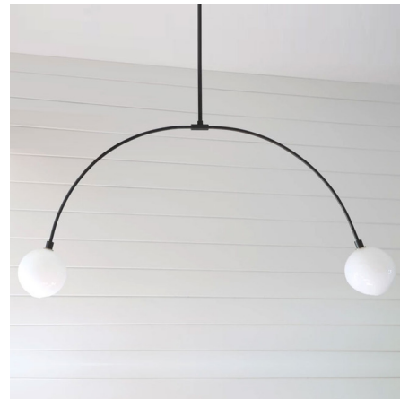
Shown in dark oxidized / opaque white

PRODUCT DIMENSIONS . . . . . Canopy: 5" diameter LUMENS/WATT . . . . . 128.57 LUMINOUS FLUX . . . . . 900 lumens