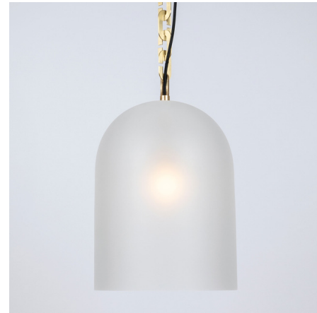
Shown in brushed brass + black cord / frosted clear

PRODUCT DIMENSIONS . . . . . Canopy: 5" diameter COLOR RENDERING . . . . . 83 CRI LAMP COLOR . . . . . 2700K LUMENS/WATT . . . . . 114.29 LUMINOUS FLUX . . . . . 800 lumens