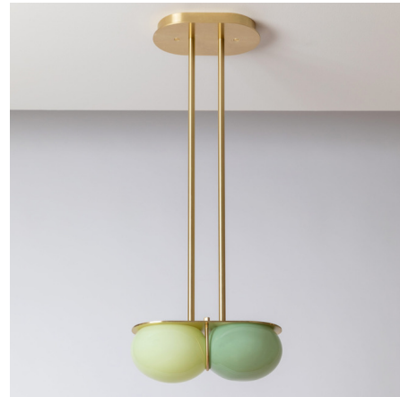
Shown in brushed brass / linden tree green / pastel green

The Twin 4.0 Pendant brings a playful aesthetic to any contemporary space. It features a two-toned Glass diffuser that is attached to a Metal base and suspended from two Brass stems. Due to the handblown glass process, all glass dimensions are approximate. Made in the Czech Republic. Note: One 6 inch, two 12 inch, and one 18 inch downrods are included as standard and allow for field adjustability. Custom, non-adjustable overall heights can be specified to order (additional fees may apply).