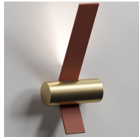
Shown in brushed brass cylinder / terracotta

The Nastro Wall Sconce features an aluminum band bent around a cylinder to create a modern, geometric fixture. The integrated LED strip allows the sconce to maintain its simple, minimalist structure. Installable upside down. Phase cut dimming. Backplate for standard US junction box is included. Note: Includes a remote driver which must be placed in an accessible remote location (remote driver dimensions: 6.3L x 1.8W x .8H). The color choice is for the structure and the finish choice is for the cylindrical weight.