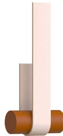
Shown in terracotta cylinder / eggshell

PRODUCT DIMENSIONS . . . . . Remote Driver Dimensions: 6.3"W x 1.7"D x 0.78"H LAMP COLOR . . . . . 2700K LUMENS/WATT . . . . . 124.13 LUMINOUS FLUX . . . . . 1862 lumens