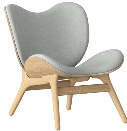
Shown in light oak / sterling

The Conversation Piece Lounge Chair is a low seat that encourages relaxation and conversation with friends. The delicate design features organic curves with no exposed fittings and an enveloping shape that allows for long periods of comfortable sitting. Solid oak legs and a molded plywood seat and back give the piece a distinctly Scandinavian expression. Available with Horizons 100% recycled polyester fabric or Teddy white 100% polyester fleece.