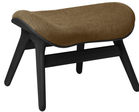
Shown in black oak / sugar brown

The Conversation Piece Ottoman is designed to complement the Conversation Piece lounge chair. The delicate design features organic curves with no exposed fittings. Solid oak legs and a molded plywood seat give the piece a distinctly Scandinavian expression. Available with Horizons 100% recycled polyester fabric or Teddy white 100% polyester fleece.