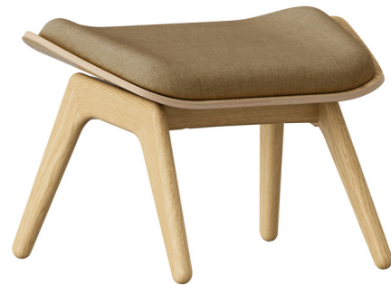
Shown in light oak / sugar brown

The Reader Ottoman was designed to complement The Reader Wing Chair. With a light form and organic curves, the Reader is perfect for adding a contemporary, Scandinavian accent to any space. Crafted with solid oak legs, laminated veneer shell, and 100% recycled polyester fabric.