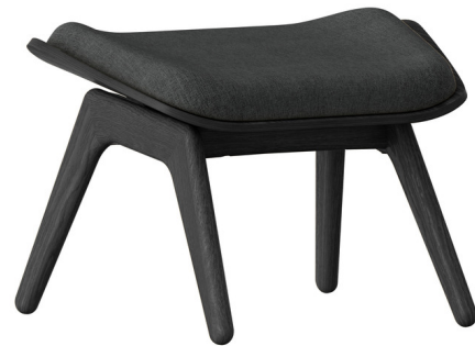
Shown in black oak / shadow

The Reader Ottoman was designed to complement The Reader Wing Chair. With a light form and organic curves, the Reader is perfect for adding a contemporary, Scandinavian accent to any space. Crafted with solid oak legs, laminated veneer shell, and 100% recycled polyester fabric.