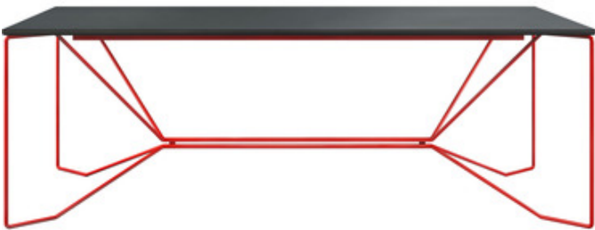
Shown in: Vermillion / Black

The Same Same Linoleum Conference Table is solid as a rock. The filigree table frame is made of powder-coated steel that is bent by hand. It consists of two identical parts that mirror each other and are screwed at two points. The linoleum table top is screwed onto the frame and reinforced by a steel frame. The special thing about the construction is that it looks so light and is still stable.