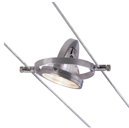
Shown in satin aluminum

Kable Lite Hello MR16 Head features a highly adjustable head that tilts between cables and rotates 140 degrees within its ring. Integral louver lens holder can hold a single glass lens, sold separately, or supplied eggcrate louver. Available in 3.5 inch or 5.5 inch cable separation. Finish in Satin Aluminum. Low-voltage GU5.3 MR16 halogen bulb up to 75 watts, sold separately. Compatible MR16 optical controls available, sold separately. ETL listed. For Kable Lite system only.