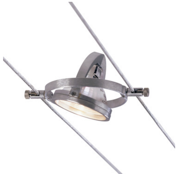
Shown in: Satin Aluminum

Kable Lite Hello MR16 Head features a highly adjustable head that tilts between cables and rotates 140 degrees within its ring. Integral louver lens holder can hold a single glass lens, sold separately, or supplied eggcrate louver. Available in 3.5 inch or 5.5 inch cable separation. Finish in Satin Aluminum. Low-voltage GU5.3 MR16 halogen bulb up to 75 watts, sold separately. Compatible MR16 optical controls available, sold separately. ETL listed. For Kable Lite system only.