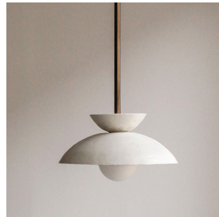
Shown in patina brass / stone

COLOR RENDERING . . . . . 90 CRI LAMP COLOR . . . . . 2700K LUMENS/WATT . . . . . 91.67 LUMINOUS FLUX . . . . . 550 lumens