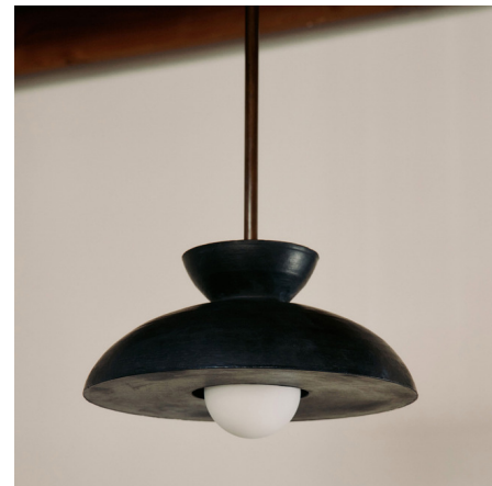
Shown in patina brass / anthracite

PRODUCT DIMENSIONS . . . . . Canopy: 4.9" diameter COLOR RENDERING . . . . . 90 CRI LAMP COLOR . . . . . 2700K LUMENS/WATT . . . . . 91.67 LUMINOUS FLUX . . . . . 550 lumens