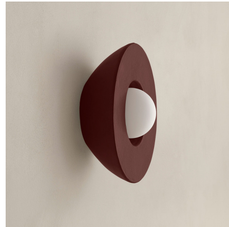
Shown in chestnut