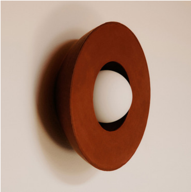
Shown in: Chestnut