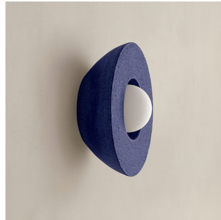
Shown in lapis