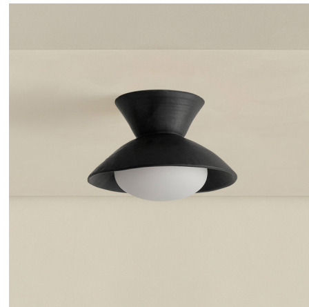
Shown in anthracite

The Cadmus Surface Mount is part of the Terra series and was made in collaboration with ceramicist Danny Kaplan. It features a tapered silhouette that offers elegance and simplicity. All mounting hardware is concealed within the clay base. Note: Due to the handmade nature of this product, dimensions may vary within one inch.