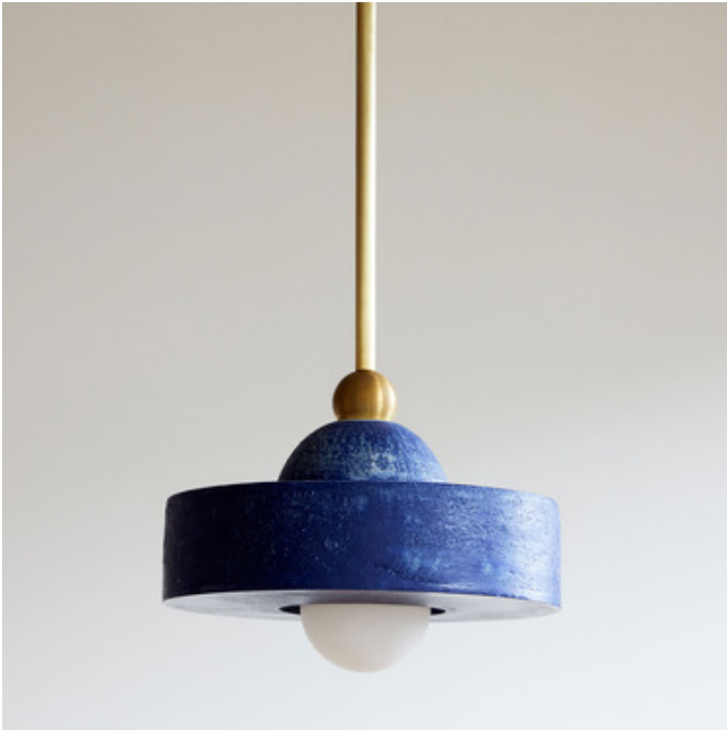
Shown in: Brass / Lapis

DESCRIPTION The Cassia Pendant is part of the Terra series and was made in collaboration with ceramicist Danny Kaplan. It features a Ceramic disc and symmetrical orbs showcasing clean lines with organic texture. It is suspended from a Brass rod with a self-leveling canopy. Due to the handmade nature of this item, no two are identical. Note: Please specify overall drop length when ordering. Stem is not field adjustable. Overall height (ceiling to bottom of fixture) longer than 36 inches is available for an additional fee.