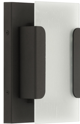
Shown in bronze / seeded glass

COLOR RENDERING . . . . . 90 CRI LAMP COLOR . . . . . 3000K LUMENS/WATT . . . . . 100.00 LUMINOUS FLUX . . . . . 800 lumens