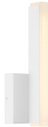
Shown in matte white / acrylic