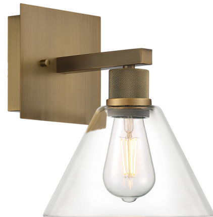
Shown in antique brushed brass / clear

With its many glass and finish options, the Port Nine Martini LED Wall Sconce by Access Lighting is the ideal piece to help you complete and customize a modern industrial lighting look. Choose from various glass shade shapes and textures, as well as from a range of finishes on the textured steel base.