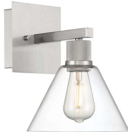
Shown in brushed steel / clear